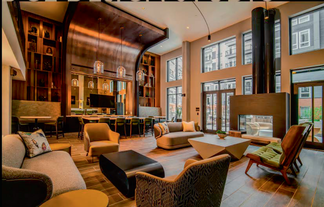
MODERA H STREET, WASHINGTON DC

Available for new construction & renovation projects nationwide